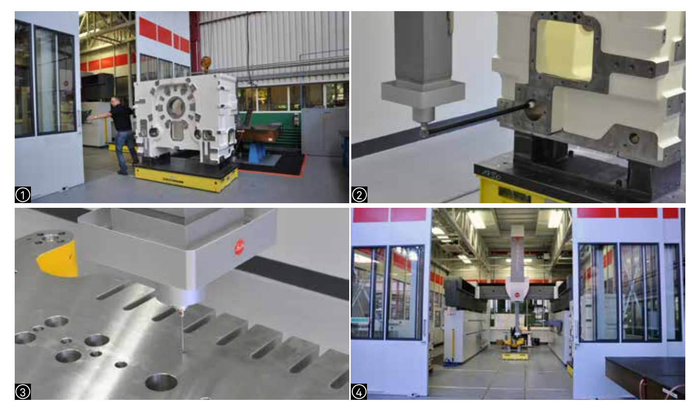
① Hexagon Metrology designed the entire Leitz PMM-G package: measuring machine and software, air-conditioned measuring room and feeding system. ② Optimum measurement precision is achieved even with long and heavy sensors. ③ Measuring a ram with the Leitz PMM-G. ④ The reinforced concrete base body ensures minimal mass movements.

Another reason for choosing the Leitz PMM-G is the fact that Hexagon Metrology is the sole contact partner, from planning through installation of the machine. "It was important to us that the measuring machine and software, the air-conditioned measuring room and the design behind them come from a single source," explained Ackermann.