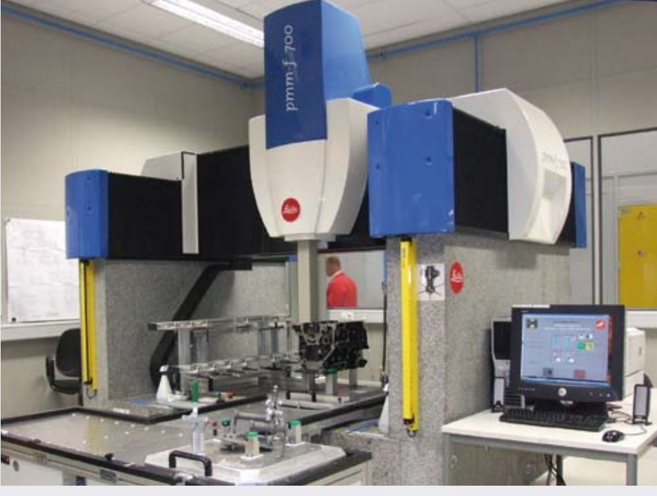
In 2002, PMM-F 700 started to be use at Audi. The process control is controlled by the quality guide lines.

Autobahn signs can already be seen some 1,5 hours Southeast of the Vienna city lines announcing the famous four interlinked rings. Immediately a vision pops into your mind: a sporty Audi racing through the spectacular landscape, hugging the passing curves of the hilly, serpentine and perfectly smooth asphalt. A part of this image your having is created by the subsidiary company AUDI HUNGARIA MOTOR Kft., which can be found in Hungarian Győr, close to the Austrian border. Over 1,9 million engines were produced here for various models of the Audi and VW Corporation in 2008. The quality assurance of the complex engines is amongst other things, measured on a total of 19 high-precision Leitz coordinate measuring machines.